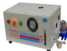
Box & Ventilation*